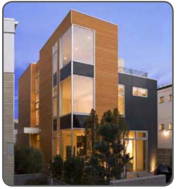
Site Pictures By: Frank Ooms Photography