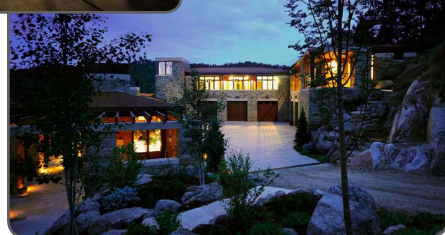
Residence Design and Photography by Arcadea Architecture