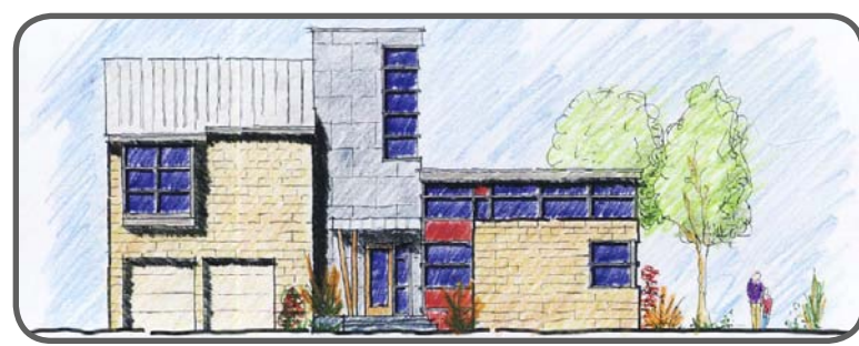
Residence rendering by Barrett Studio Architects

Located in Prospect New Town, a New Urbanist community, these residences offer private courtyards with quick access to neighborhood amenities such as grocery stores, coffee shops, sushi bars and community parks. Site design included drainage, grading, erosion control and determination of finished floor elevations. Design required ADA access and patio courtyard drainage; integrating form and function.