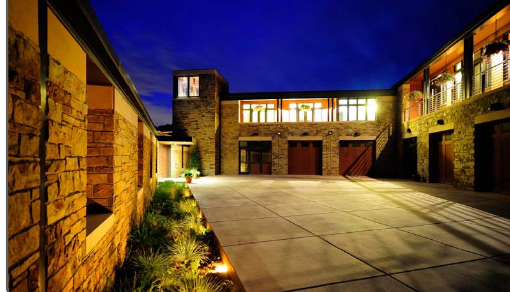
Residence Design and Photography by Arcadea Architecture